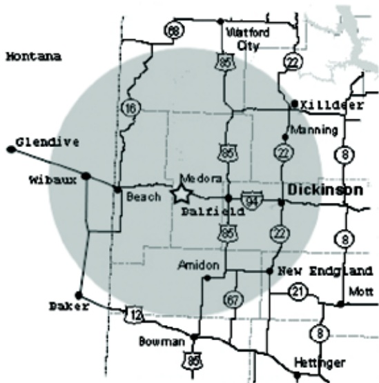
Shaded Area is Local Area