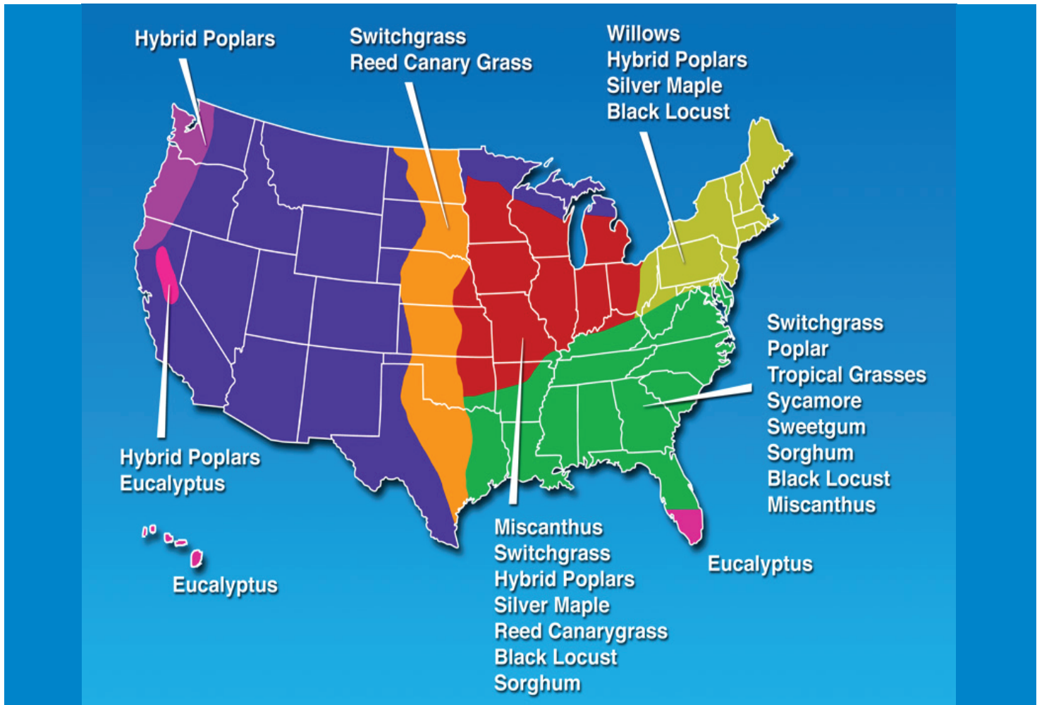
Figure 3. Herbaceous and Wood Crop Possibilities as Suggested by the Department of Energy

shown to be active against methicillin-resistant Staphylococcus aureus and vancomycin-resistant enterococcus (Sherry, Boeck, and Warnke, 2001). Thus, Eucalyptus would be an excellent candidate to demonstrate the feasibility of subcritical extraction of useful phytochemicals and conversion of the biomass to liquid fuels, indicating that the concept of bridging two unrelated research areas is possible.