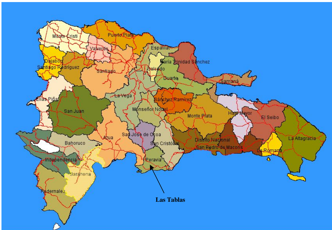
Figure 1: Map of Dominican Republic