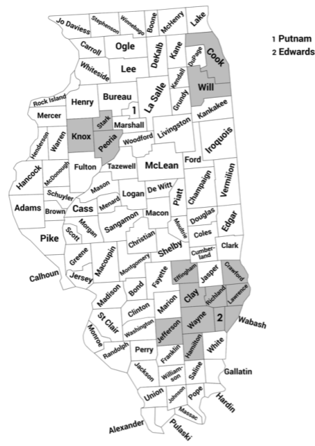
Figure 2: Counties Represented by a Bill Sponsor