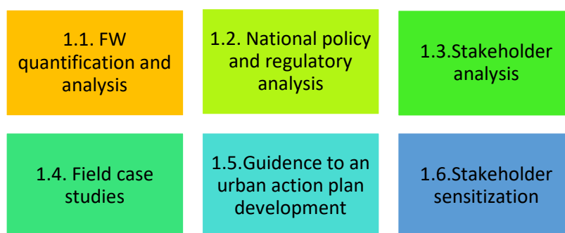
Figure 1. Innovative approaches to reduce, recycle and reuse food waste in urban Sri Lanka (2019–2021) project structure

The main objective of the project was to facilitate, through a collaborative effort, the drafting of an Urban Roadmap and Action Plan on food waste Prevention, Reduction, Management in Sri Lanka that identifies concrete steps to implement towards achieving Sustainable Development Goal 12.3 (SDG 12.3).