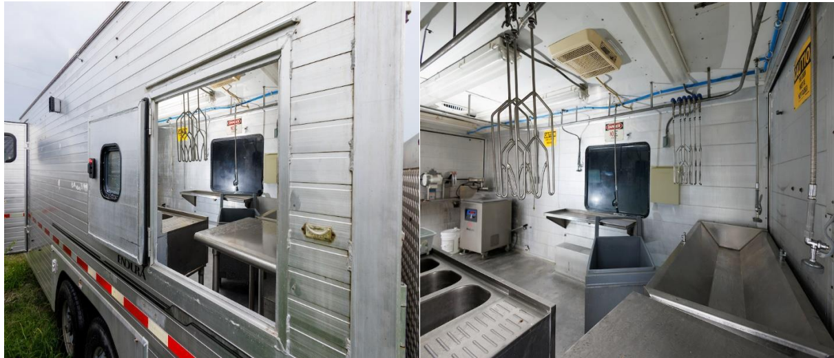
Figure 3. Kentucky State University Mobile Processing Unit ( https://www.kysu.edu/news/2017/11/kentucky-state-university-mobile-chicken-processing-unit-one-of-few-in-the-country.php )

For over 20 years, KSU's MPU has been helping small-scale poultry farmers get their products into the hands of consumers. The MPU is a 20-foot-long, farmer-friendly processing facility on wheels with hot water heater, water lines and electricity. It can be transported to other locations, with approved docking stations – a huge benefit for farmers who can process 100 birds for $134.50. There are at least four approved docking stations available in Kentucky: the KSU Harold R. Benson Research and Demonstration Farm, the Morehead State University farm, the Jackson County Food Kitchen, and the Laurel County African American Heritage Center. These docking stations are subject to inspection by local, state, and federal officials at any time without notice. Other USDA-inspected and/or state-licensed poultry processing facilities include the Central Kentucky Custom Meats Inc., the Marksbury Farm Market, and SS Enterprises of Warren County (Ellis, 2021).