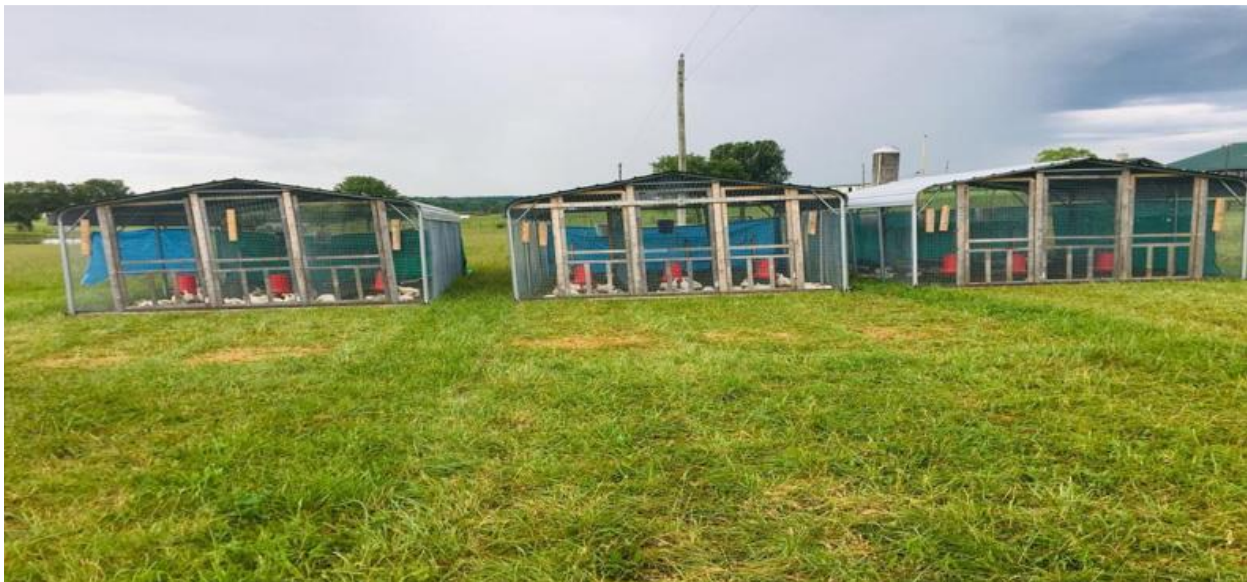
Figure 2. Broiler Chickens in pens on pasture at KSU's Harold R. Benson Research and Demonstration Farm

There are at least five known housing types currently in use, all of them a modification of Joel Salatin's pioneering design (SARE, 2012; Bare and Ziegler-Ulsh, 2019). These are (1) Floorless Pastured Poultry Pens that are usually moved to fresh pasture daily; (2) the "Net Range" (or "Day Range") made up of movable housing with shelter access for feeding, rest, and shade against predators and inclement weather; (3) Free Range Systems that allow birds to range freely, returning to portable housing units in the evening or during unfavorable weather conditions; (4) Yarding System where birds are kept in permanent housing but allowed to pasture during the day, and (5) the bottomless Chicken Tractor Model, in different sizes with complete feeding and watering accessories. The chicken tractor may be designed with wheels or sliding material to be easily moved to different pasture locations daily (SARE, 2012). Figure 2 shows a chicken tractor model, or "carport" high enough for easy in and out walking, and good airflow with hanging feeders and waterers easily moved by a tractor for broiler production at the KSU Harold R. Benson Research and Demonstration Farm.