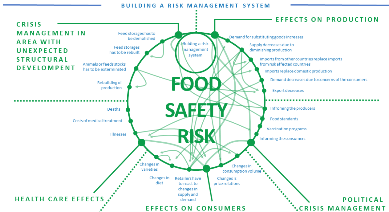
Figure 1. Framework for food safety risks

The changes in the regional production have effects also on other areas because the replacing food production is necessary. This may mean that the production of corresponding goods in other areas increases or substituting products are produced instead.