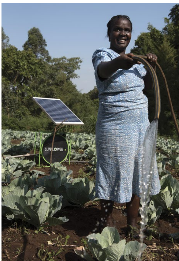
FIG. 2: SOLAR IRRIGATION IN AFRICA

Investments in smallholder ALWM are transforming food security and livelihoods in Asia and Africa. The scale of current investments by smallholders is astonishing, and the potential in terms of benefits