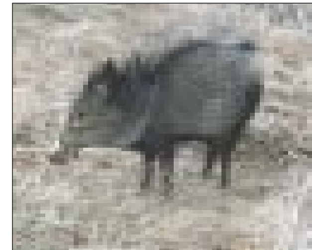
Figure 2 —Wild pigs don’t all look alike. Some take after the Eurasian wild boar (top left); others (bottom left) look almost like domestic pigs. The javelina, or collared peccary (above) is native to the Southwestern United States.