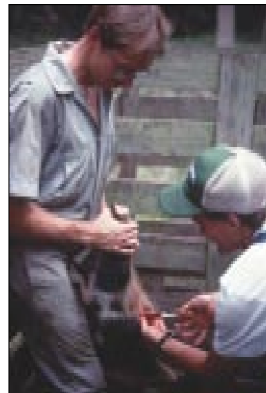
Figure 3— Before you move wild pigs, get them blood-tested by a veterinarian to be sure they are free from diseases that could be transmitted to domestic pigs or people.

Both State and Federal laws govern disease control programs for swine brucellosis and pseudorabies in all classes and types of swine. Relocating wild pigs without negative blood tests for these diseases violates the law. Before wild