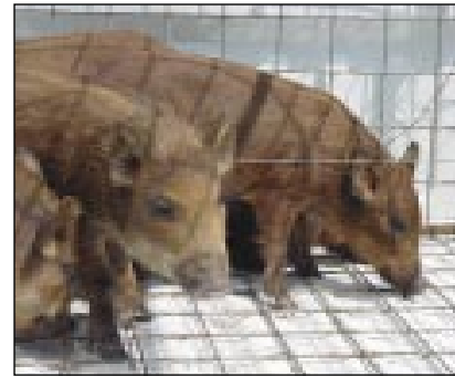
Figure 4— Cage traps are effective in trapping wild hogs, especially when food supplies are limited, as in winter.

pigs are moved, they should be blood-tested by a veterinarian to certify that they are free from disease.