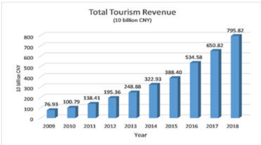
Table 1. Total Tourism Revenue from 2009 to 2018

The beautiful natural scenery, many historical and cultural monuments, rich ancient customs in Dali to become the Yunnan province tourism industry started one of the first regions. Since the 1980s to the late 1990s, Dali tourism industry has been rapid development, has become a popular tourist destination in Yunnan province city.