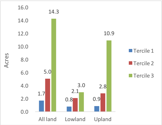
Figure 1: Mean operated agricultural landholding, by landholding tercile.

Farm landholdings are unequally distributed. The average area operated by the largest third of farms (tercile 3) is 14.3 acres. This is more than 8 times greater than that of the smallest farms (tercile 1), which operate on average only 1.7 acres [Figure 1].