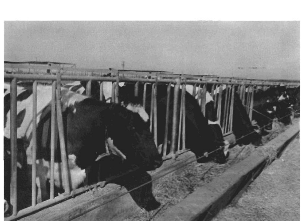
KERN COUNTY HOLSTEIN DAIRY