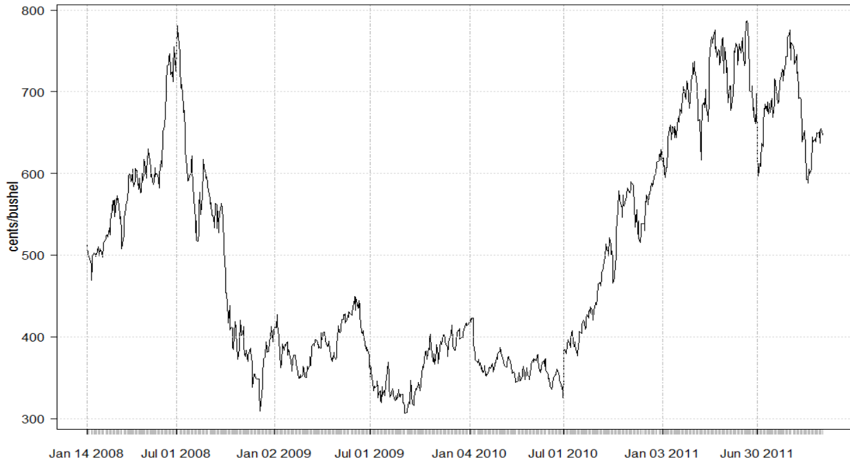
Figure 1: Daily Nearby Corn Futures Settlement Price

NOTES: Daily nearby corn futures settlement prices are obtained from the CRB database. The nearby contract is rolled over to the first deferred on the first trading day of nearby expiration month. The time horizon is from January 14, 2008 to October 31, 2011.