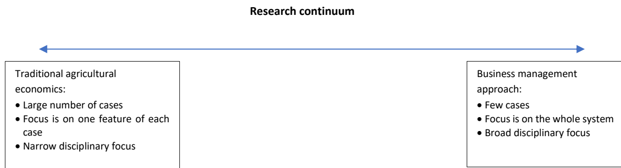
Figure 1. Continuum of research methods (adapted from Crosthwaite et al. 1997).

One of the first steps in doing research is to decide the appropriate research method to use. A continuum of research approaches exists in agricultural and farm management economics, ranging from a narrow discipline focus involving sizeable samples of populations through to a multi-disciplinary focus on a small number of 'cases' from a population (Figure 1).