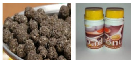
Figure 3. Soybean afitin (left) and Dadonu soja (right)

As far as the soy afitin sub-project is concerned, it was envisaged to improve the soy based-afitin product. However, soy-based afitin is not stable for long-term preservation because it is a fresh product. Moreover, Afitin alone cannot substitute commercial taste enhancers mainly because it is not able to raise the taste of foods the same way. In this regard, a soy-based recipe was produced by mixing powdered Afitin with diverse spices in order to enhance the fermented soybean cotyledons. This recipe is called ‘Dadonu’ which means a local taste enhancer. ‘Dadonu’ is mainly composed of soybean and spices.