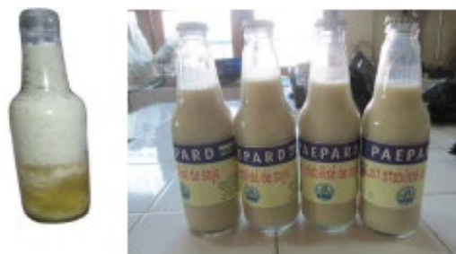
Figure 2. Status of unstabilized soy milk (left) and stabilized (right) 24 h after production

Technologies developed revealed interesting results. The technology developed in the soy milk sub-project yields 12 L of soy milk per kg of soybean as compared to 08 L of soy milk per kg soybean when using the traditional technology. In the same way, the shelf life of the stabilized soy milk is more than 6 months, whereas this was at most 24 hours with the traditional technology.