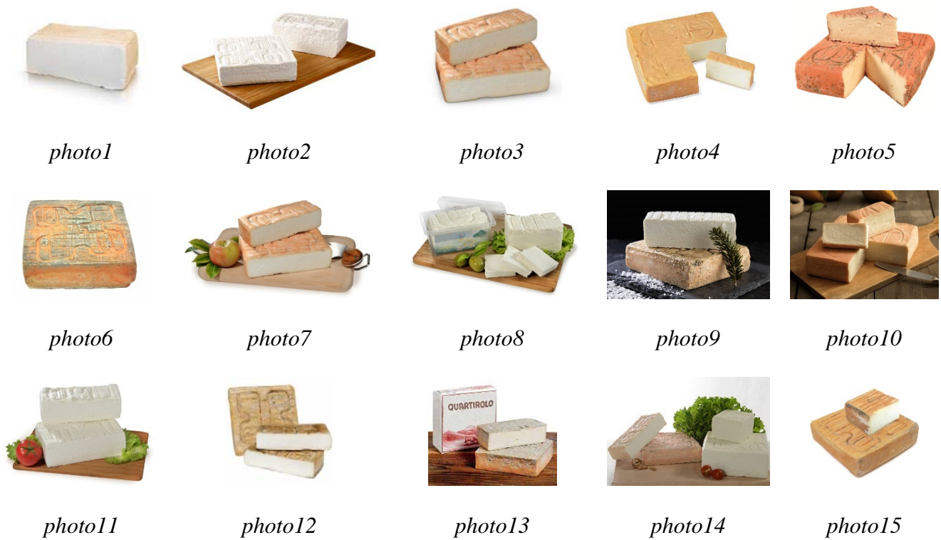
Figure A.2. Cheese images evaluated in the pilot study