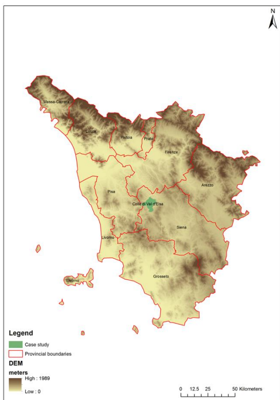
Figure 1: Case study.

The area affected by the fire includes areas covered by mixed forests of conifers and broad-leaved trees, with a prevalence of Mediterranean pines and cypresses (domestic pine, maritime pine, Aleppo pine).