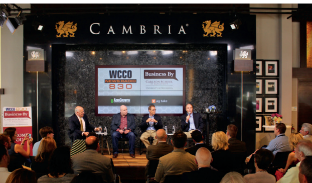
Business by Carlson Panel at WCCO Radio Studio