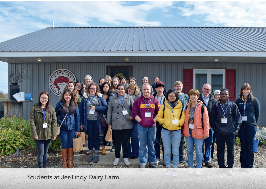
Students at Jer-Lindy Dairy Farm