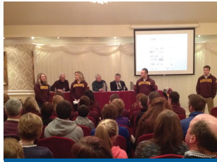
Student Business Plan Presenters