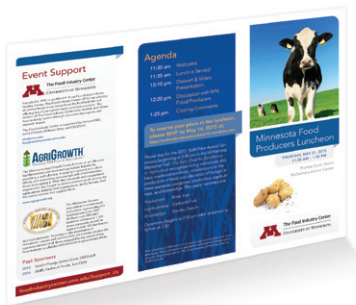
2015 Minnesota Food Producers Luncheon

This year's luncheon, sponsored by TFIC, Minnesota Agri-Growth Council, and Minnesota Grocers Association, was held on May 21, 2015 prior to the annual Siehl Prize awards ceremony.