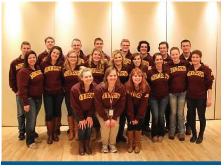
International Dairy Student Group