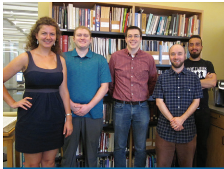
Applied Economics Doctoral Students

Faculty working in TFIC have a number of doctoral students funded by government and industry at the present time. We have been very competitive in securing external funding for our graduate student's tuition, stipend, insurance and benefits, and funding for travel to present research at conferences. Here is a summary of what some of our students are doing.