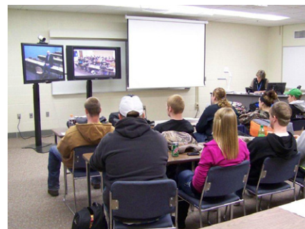
Students at Ridgewater College listen to a discussion on food marketing