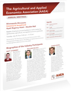
Employer Panel at AAEA Meetings

Feel free to contact me at boland@umn.edu or 612.625.3013 about any issue.