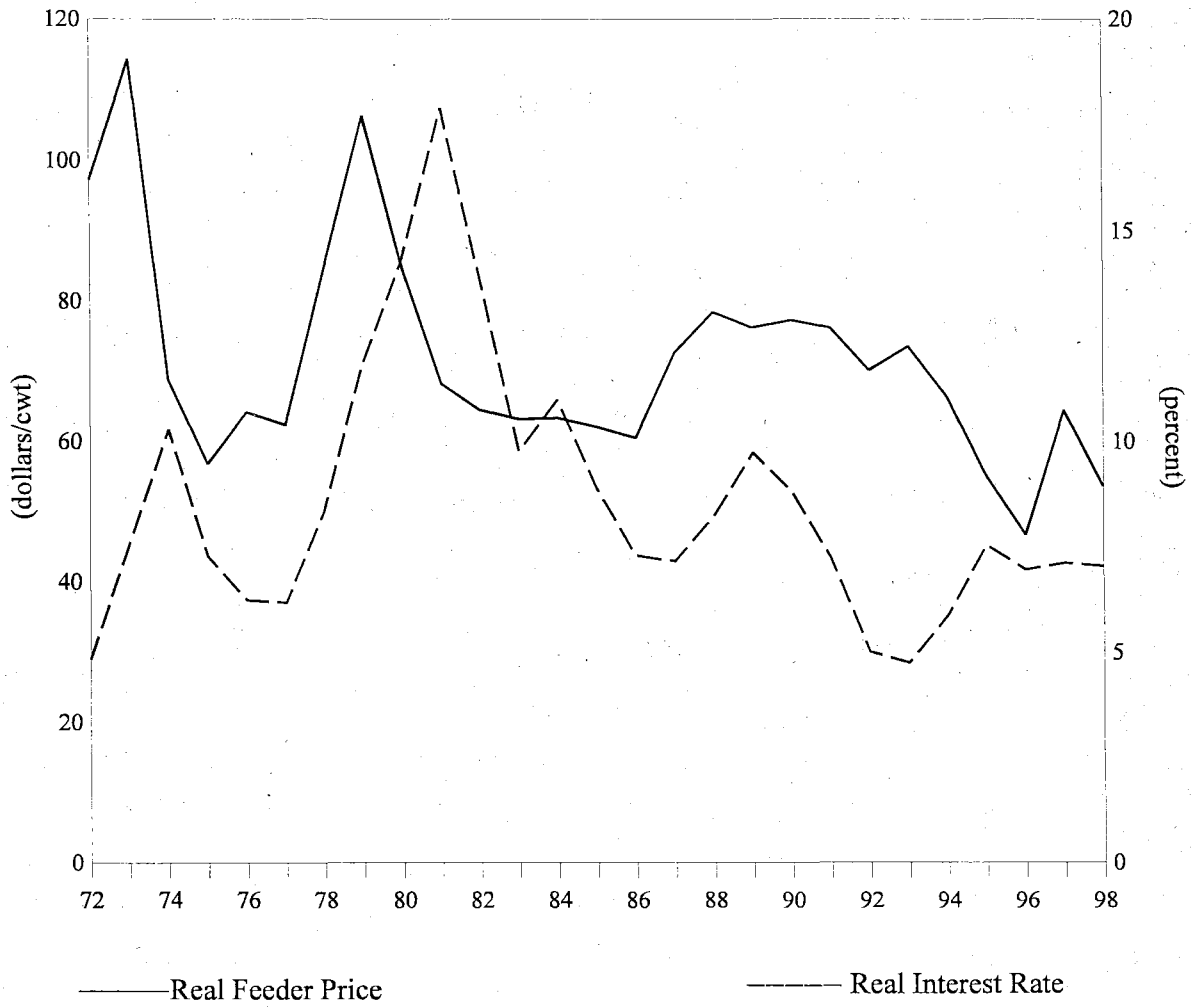
Figure 1. Real Feeder Steer Price and Real Prime Interest Rate