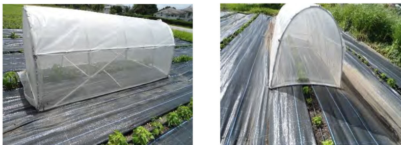
Figure 1. Two views of row cover.