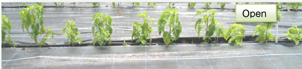
Figure 4. Leaf from covered plants vs. leaves from open.