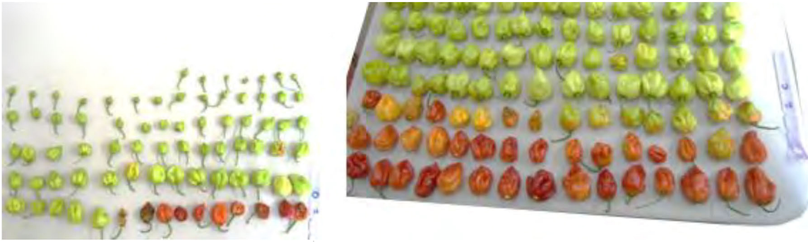
Figure 2. Fruit from open plot (left) versus from covered plot (right).