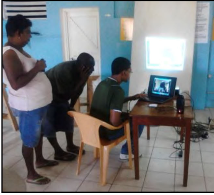
Figure 4. Framers from the focus group communicating via Skype

Finally, the concept of using mobile phones as a major tool for reaching out the farmers and transmitting timely and low cost information was highly accepted amongst the group and the use of mediums such as SKYPE and You tube can communicate with a large group at once without being physically present for a face to face meeting.