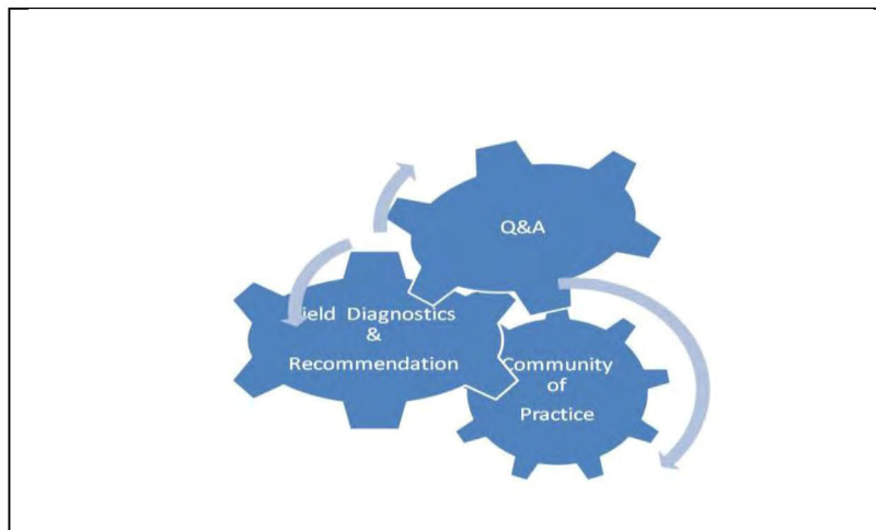
Figure 3. Visual represent the development process of the three modules of the system.