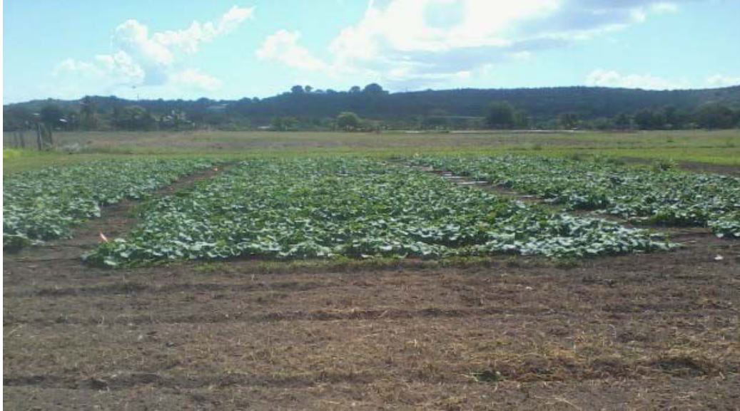
Fig.1. Nine cultivars of cucumber were planted using randomized complete block design with three replicates. UVI-AES horticultural experiment field on St. Croix, Kingshill Campus