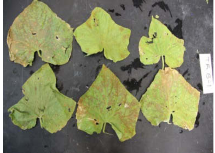
Fig.3. Leaves were randomly picked, photographed, and then sent to NC State Plant Disease Diagnostic laboratory (Todd Wehner) to process with a disease severity assessment key and statistical analysis