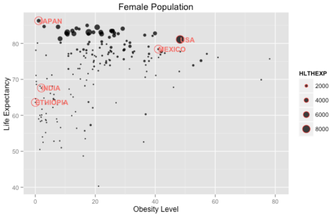
Figure 2: Country wise life expectancy of females (in year 2010) as a function of obesity prevalence (percentage of population aged 15 and above that has BMI >30) in 2010.

HLTHEXP is per capita health expenditure in US dollars (PPP int. $).