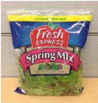
5 oz. bag of washed salad greens

What percentage of the product are you (or your household) likely to consume, based on your recent consumption habits?