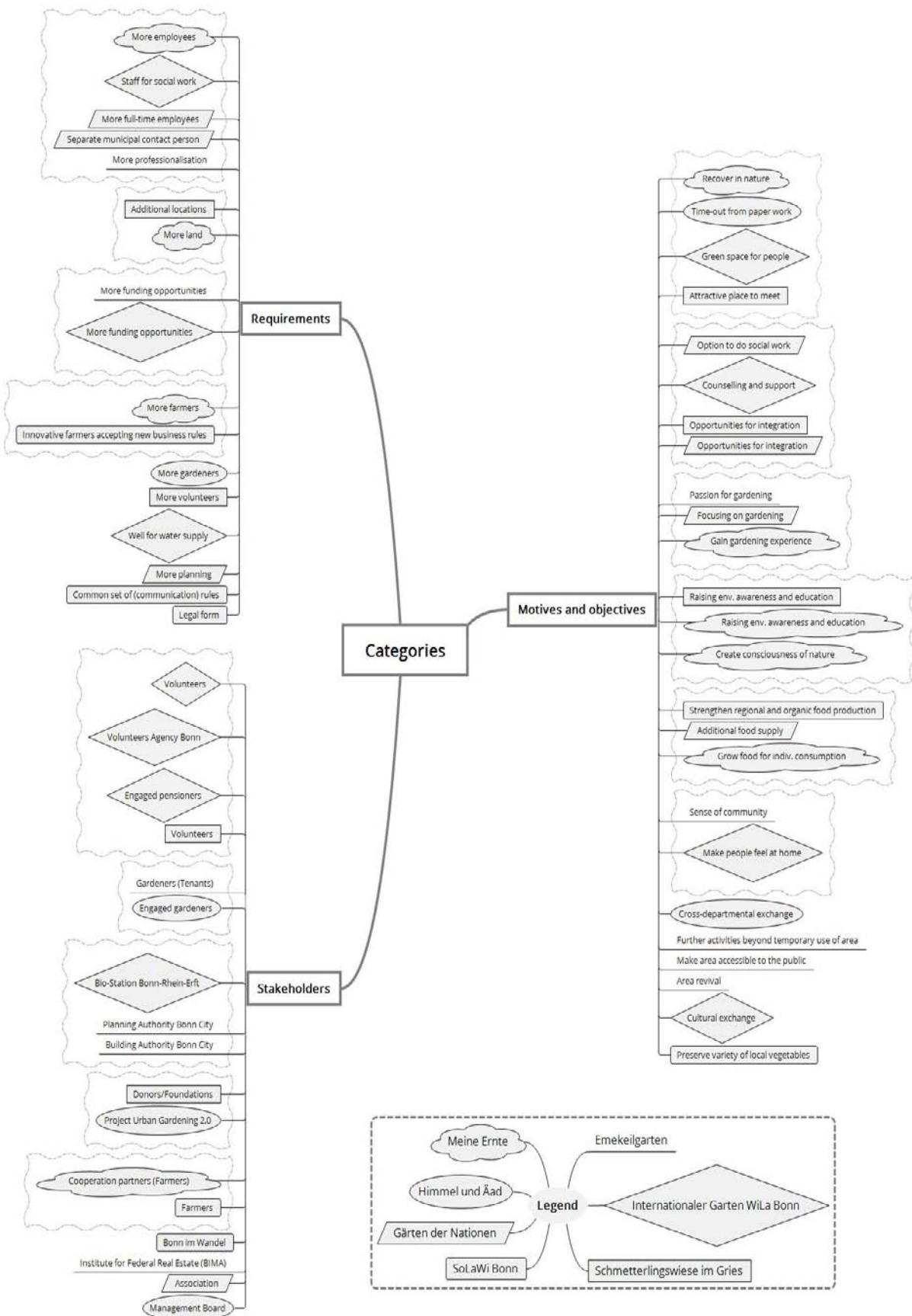
Figure 1: Analysis of the guided interviews (Mind-Map)