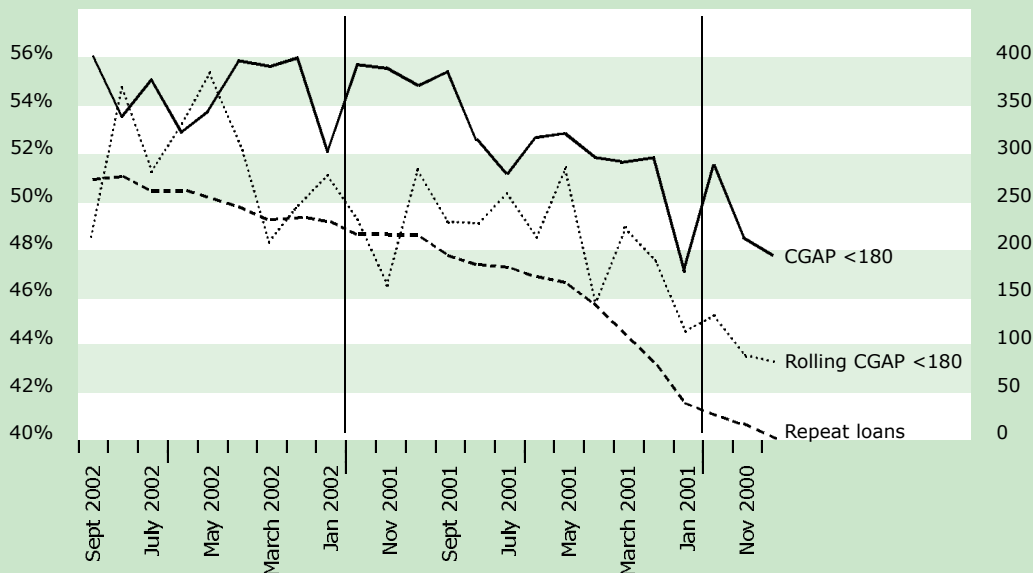
Trends in Partner exit rates

Graphic information about client exit (such as this graph), is extremely useful for seeing patterns in exit – for example seasonal variations – and where a rolling rate is calculated a trend over time is also observed.