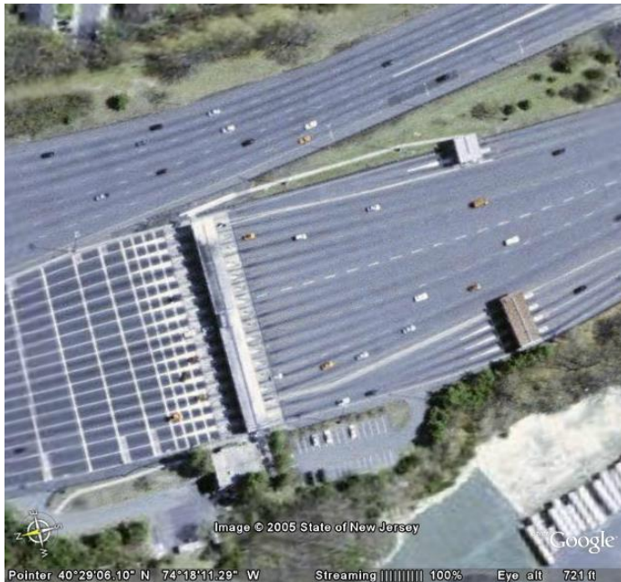
Photograph 1: Satellite photo of the Southbound Raritan Toll Plaza, pre-high speed ETC

For example, the Southbound Raritan Toll Plaza on the Garden State Expressway in New Jersey (Photograph 1), as it was configured from 1999 to 2004, represents a traditional mix of full service, exact change, and slow speed ETC. The main plaza containing the 17 main line lanes is shown on the left with the two eastern slip lanes at top right and the four western slip lanes at bottom right.