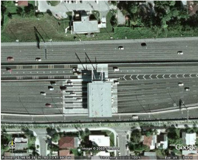
Photograph 2: A Hybrid Plaza on the Florida Turnpike

On the other hand, the Florida Turnpike (Photograph 2) operates a hybrid plaza with both high speed ETC (top) and manual and slow speed ETC collection (bottom) segments.