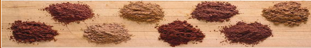
Grape Skin and Seed Flours