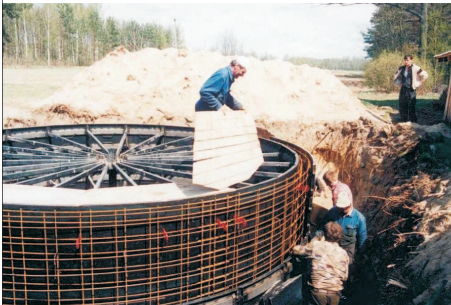
Figure 2: Construction of Slurry Storage Tank in Poland

prove efficiency and expand their production, e.g. by increasing stocking rates. There is also pressure to change to milk production because far better returns are possible than from arable cultivation.