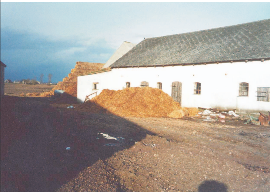
Figure 1: Animal Waste Stored on the Ground in Polish Countryside

The accession negotiations with the European Union (EU) have transformed the political status of the farm–pollution problem. Poland is required to implement the environmental acquis , including the Nitrate Directive. Water pollution from nitrates is no longer a concern only of experts. It has acquired wider political ramifications in the context of debates and negotiations about how to prepare Polish agriculture to participate in the Single Market. The need for and the practicalities of equipping farms with manure storage facilities – in order to comply with the Nitrate Directive – have become matters of considerable contention involving a range of organizations.