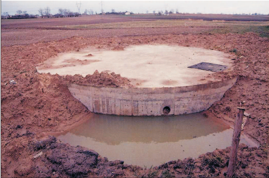
Figure 3: Underground Slurry Storage Tank

plication of fertilizers, as well as the permissible doses of natural fertilizers. The Act also requires farmers to store slurry in tanks with capacities sufficient to store at least four-months' worth of manure production (Fertilizers and Fertilization Act, 2000).