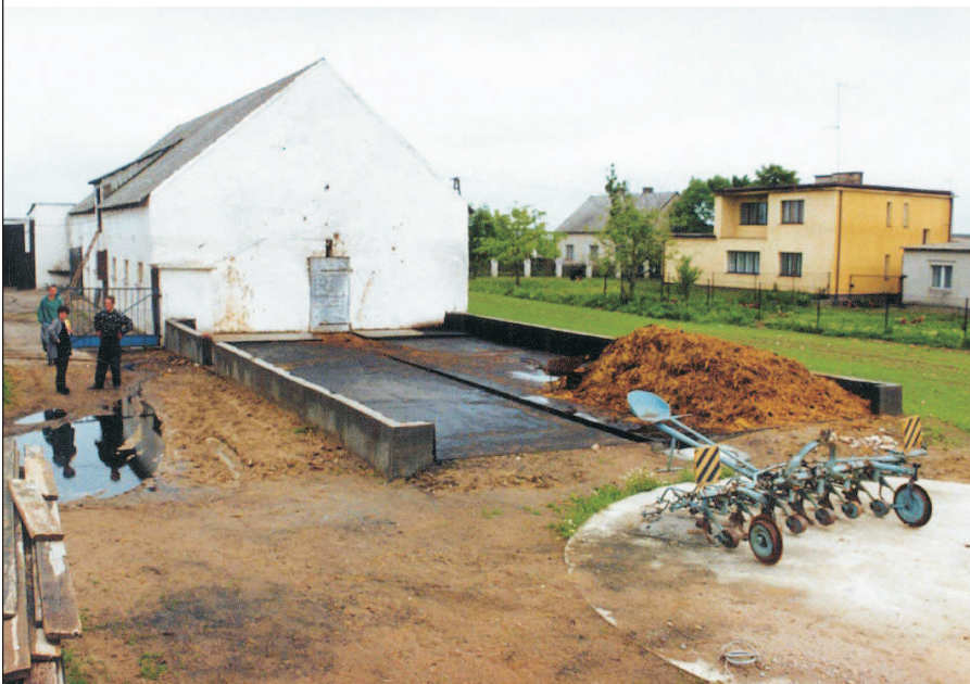
Figure 5: Manure Stored on Concrete Pad

In December 2001 the Lithuanian Environmental and Agricultural Ministries issued a joint order as part of the process of implementing the Nitrate Directive. The order specifies the maximum stocking density (1.7 LU/ha) and requires that farms with more than 10 LU (about one-fifth of all farms) must eventually have a six-month manure storage capacity. In the short term farms with more than 300 LU, as well as newly established farms, must establish manure storage facilities. Farms with more than 150 LU should establish storage facilities within four years following EU accession, and farms with more than 15 ha of arable land must prepare annual fertilization plans (Sileika, 2001). The remaining farms with more than 10 LU should carry out the necessary modernization of their manure storage, but the timetable is unspecified.