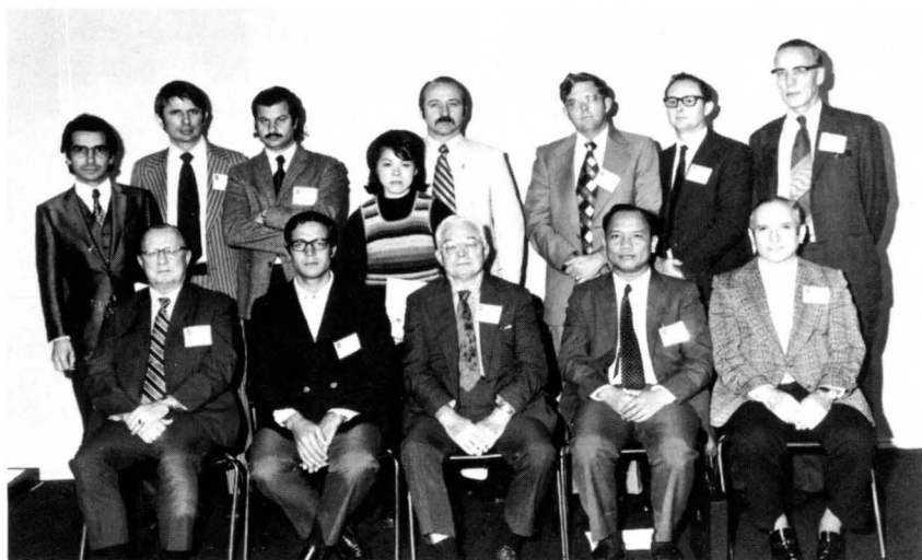
DISCUSSION GROUP 14. NEW ANALYTICAL TECHNIQUES IN MARKETING