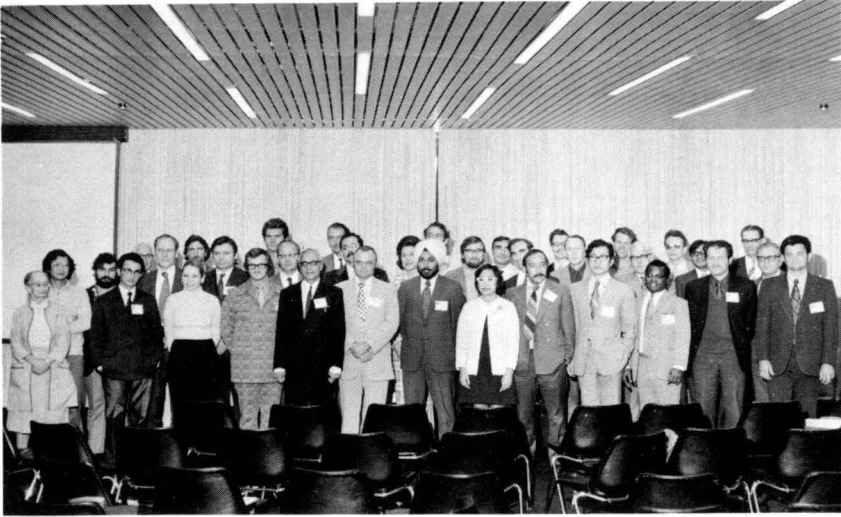
DISCUSSION GROUP 9. POLICY ON RURAL EMPLOYMENT AND INCOME REDISTRIBUTION