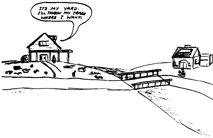
SCENE I. INDIVIDUAL DECISION — PERSONAL

Scene I shows a yard littered with trash as a result of Joe's personal decision, "It's my yard, I'll throw my trash where I want!" The individual is exercising his right to make a personal decision.