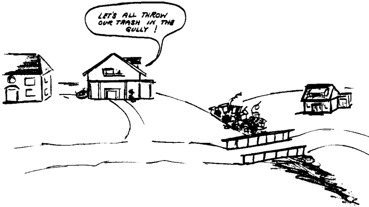
SCENE II. INDIVIDUAL DECISION — AGGREGATE

Scene III shows a setting with more houses and more people. It is no longer possible just to throw the trash in the gully. This stage of development has spawned a problem greater than can be solved by individual decisions. The group permissive decision allows the community to contract to have “ Sam haul away our trash! ” Each home owner has the opportunity to participate for a fee of perhaps $2.00 per month. While participation is voluntary, there may be some arm twisting if Joe’s yard begins to look or smell too bad.