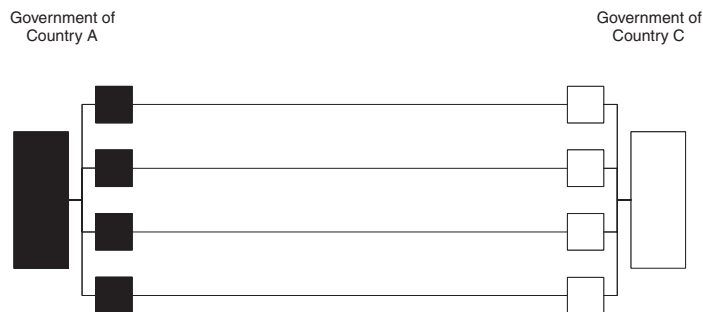
Figure 2.2: Significant regulatory coordination has taken place through “workaday cooperation” among the NAFTA partners.

Note: This figure is similar to Figure 2.1, except that the interactions between the staff of the national governments are taking place on a bilateral rather than a trilateral level.