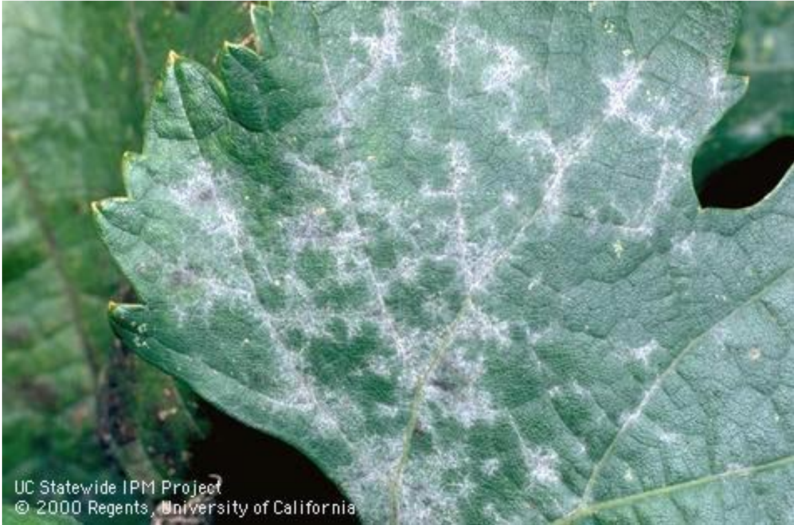
Figure 1: Grape powdery mildew