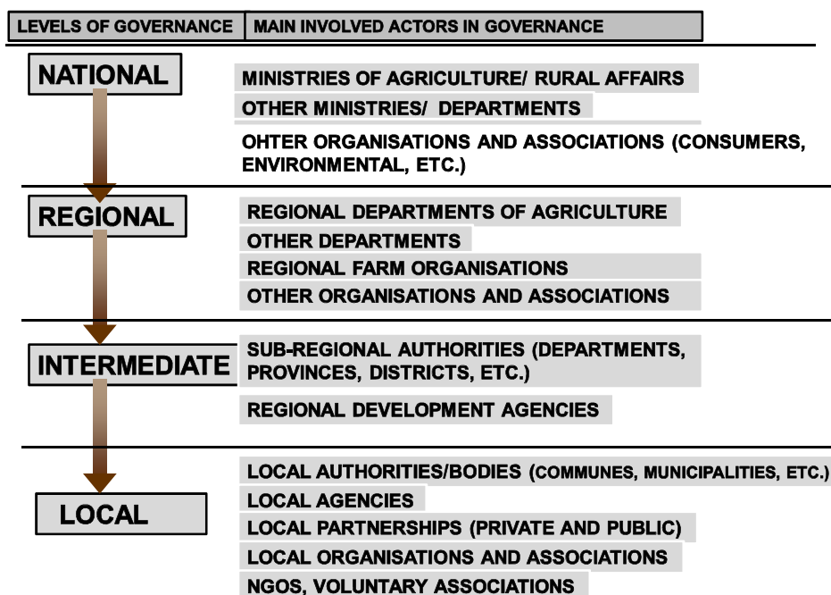
FIGURE 6.2 MULTI -LEVEL GOVERNANCE OF RURAL DEVELOPMENT POLICIES

Different actors operate on each of the levels identified, not only of an institutional type, but also including farmers' organisations, associations, and economic and social representatives (Figure 6.2). The relative importance and specific role of the various levels varies depending on the institutional structure of each country. In the more centralised countries the national level predominates, whereas in the more decentralised systems the intermediate and local levels have greater articulation and more important roles. 2 A better understanding of the organisation of the different system can be reached if we separate the different activities of the planning and management of rural development policies and analyse how they are distributed among the levels and actors. Thus, three different systems of governance can be distinguished: