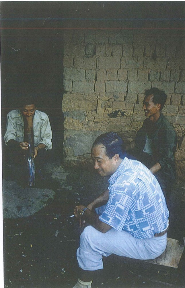
Photograph 2: Leaders in the village of Zhong Tian Ba discuss with the authors the problem which they encounter with wildlife from the nearby Mengyang subreserve.