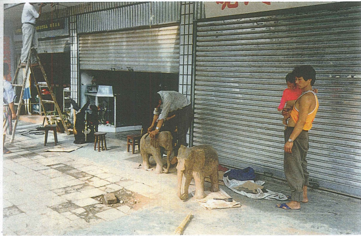
Photograph 1: Carving wooden elephants on the footpath in Jinghong, the capital of Xishuangbanna Prefecture. The carvings are for sale to tourists