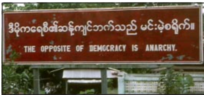
Example of Burma's State-sponsored signs

ignoring the customary system of land use. The most significant land problems in Burma remain those associated with landlessness, rural poverty, inequality of access to resources, and a military regime that denies citizen rights and is determined to rule by force and not by law. A framework to ensure the sustainable development of land is needed to address social, legal, economic, and technical dimensions of land management. This framework can only be created and implemented within and by a truly democratic nation.