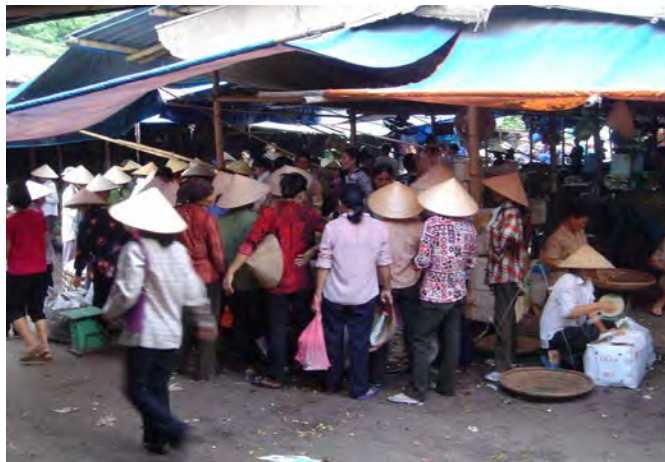
A modern supermarket in Asia (top photo), compared to traditional markets (lower photos).