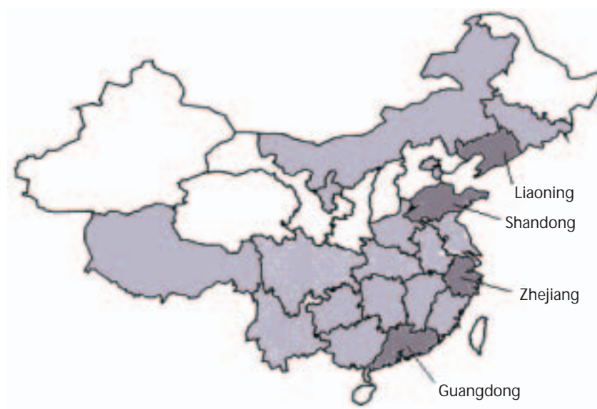
Figure 3. Outbreaks of bovine ephemeral fever in China, 1955–1991. Darker shaded areas indicate provinces where major epidemics have occurred.

The distribution of BEF in China is shown in Figure 3. It is evident that major epidemics have been reported in Guangdong province of southern China, Zhejiang and Shandong provinces of central China, and Liaoning province in northern China. Clinical cases of the disease have been reported in several other provinces marked on the figure. Years in which major epidemics have occurred are listed in Table 2.