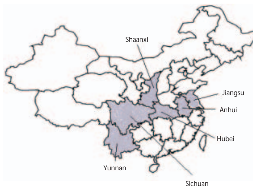
Figure 2. Outbreaks of bluetongue disease in sheep in China (1979–1997).

clinical disease, is present in Southeast Asia, Papua New Guinea, northern South America and northern Australia (Stott 1998). Several types of the bluetongue virus are present in Australia, but natural bluetongue disease has occurred only twice, in small outbreaks in the Northern Territory.