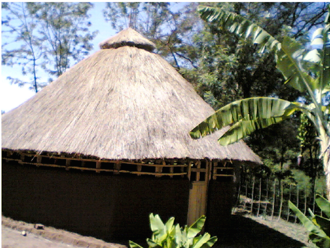
Photo 1: Beehives house in Vi Agro Forestry (Kitale) demonstration farm

extension staff trained in relevant agricultural disciplines to certificate, diploma or degree level. Most extension service providers are promoting commercialization of small-scale agriculture. This involves communities identifying the crops that can grow in their area and the program assists them to produce such crops as a viable commercial enterprise. Training is also on marketing and calenderization (not to grow when every body is growing to avoid depressing output prices). For example Care-Kenya (Homabay) supported groups are now growing high value basmati rice, high oil content sunflower, grafted mangoes, and new high value crops like okra (for seeds) and industrial chili.