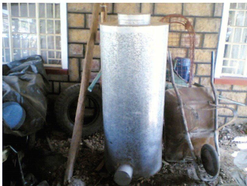
Photo2: Small scale grain silo promoted by Catholic Dioceses of Homa Bay

Sustainable agriculture- promotion of organic farming, agro forestry and soil conservation.